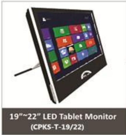
19"~22" LED Tablet Monitor (CPKS-T-19/22)