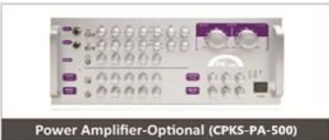
Power Amplifier-Optional (CPKS-PA-500)