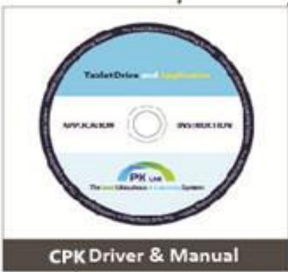
CPK Driver & Manual