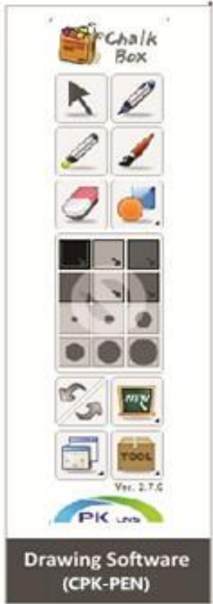
Drawing Software (CPK-PEN)