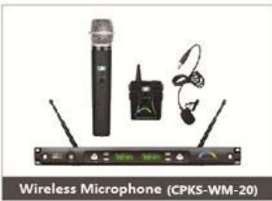
Wireless Microphone (CPKS-WM-20)