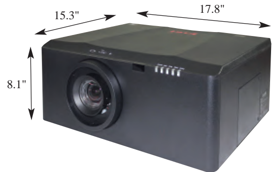
EK-612X • XGA • 1-chip DLP® projector.