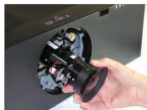
Easy to change lenses.